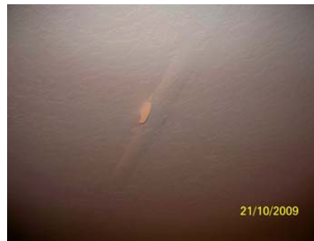
18.) Drywall flaw in ceiling of north bedroom.