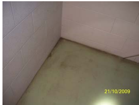
23.) Evidence of past moisture in basement.