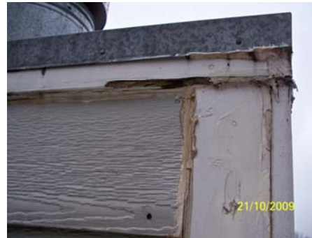
8.) Deteriorated siding trim at chimney.