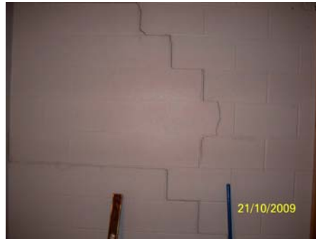
1.) Settlement crack on west wall.