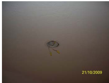
13.) Missing light fixture.