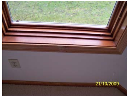
19.) Water stain on sill.