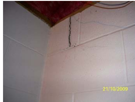
2.) Displacement of block on west wall.