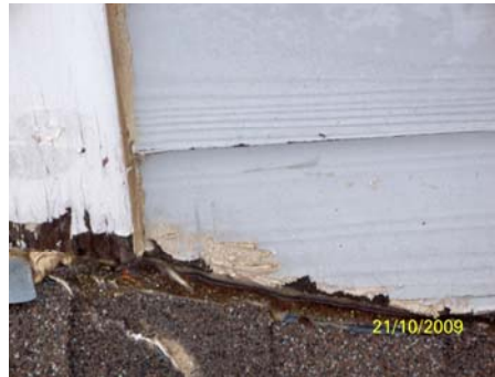
7.) Deteriorated siding at chimney.