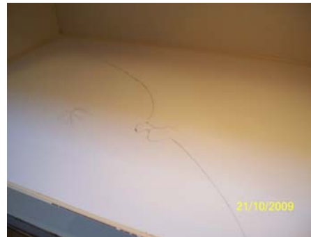
24.) Crack shelf in microwave.