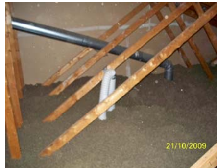
16.) Bath exhaust vented to the attic.