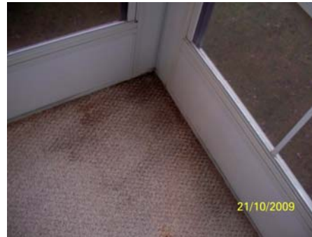
20.) Past water penetration at three season porch.