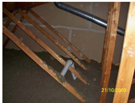
17.) Bath exhaust vented to the attic.