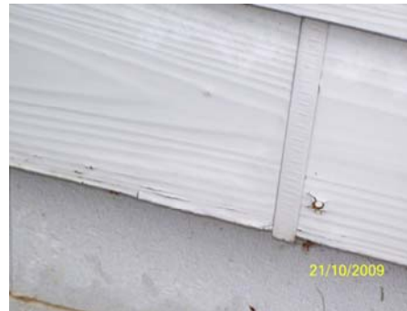
10.) Siding delamination.