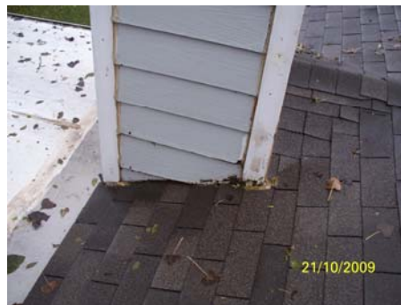
5.) Insufficient clearance siding/roof.