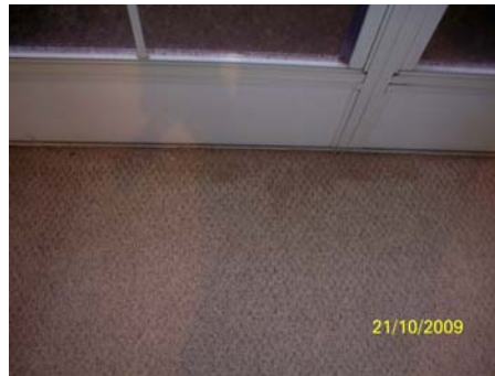
21.) Past water penetration at three season porch.