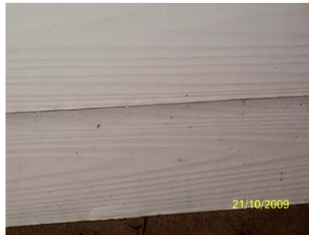
9.) Siding delamination.