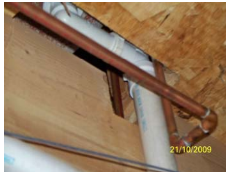
3.) Notched floor joist.