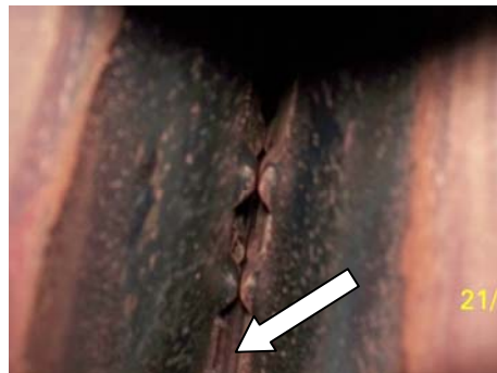
15.) Possible crack in exchanger.