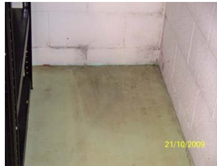
22.) Evidence of past moisture in basement.