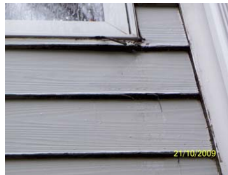
6.) Deteriorated siding.