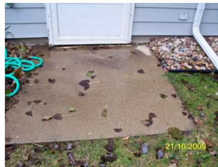
12.) Slab sloped towards home.