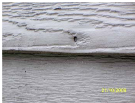
11.) Siding delamination.