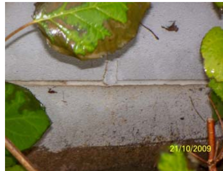
4.) Sheer crack on west exterior wall of garage.